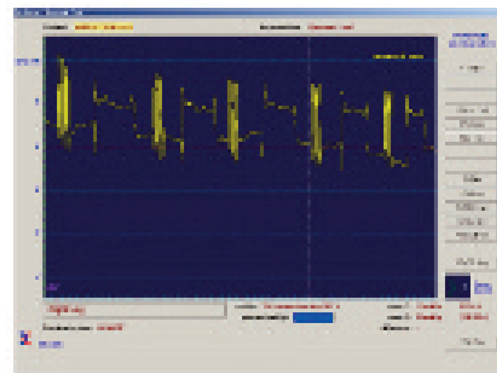
Velcro Wrap* 0hr

The garments can be termed “short stretch” and perform well even after 24 hours. Demonstrating validity as compression for venous and oedematous conditions