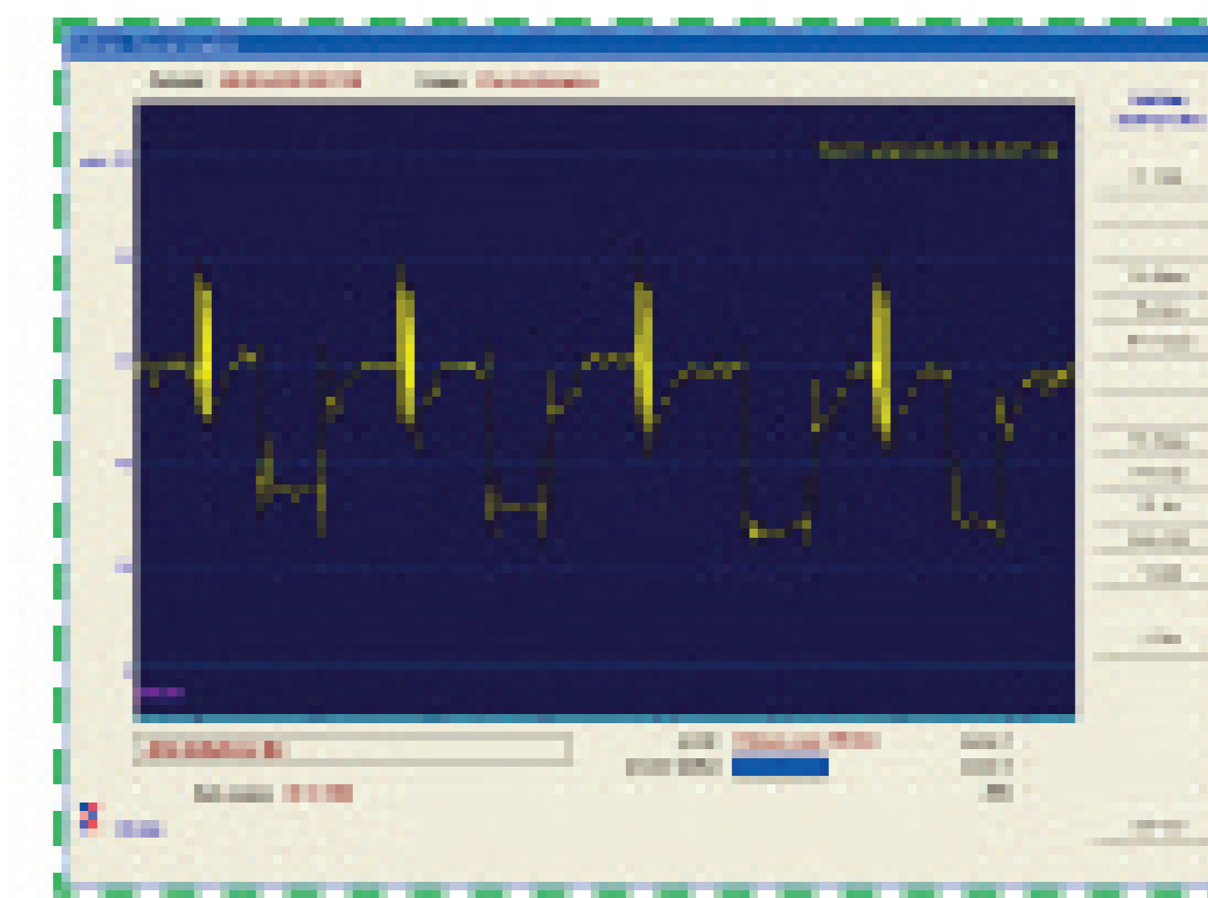
SSB** 0hr, 15 min. Note pressure drops

The reproducibility of the data gives reassurance about the technique.