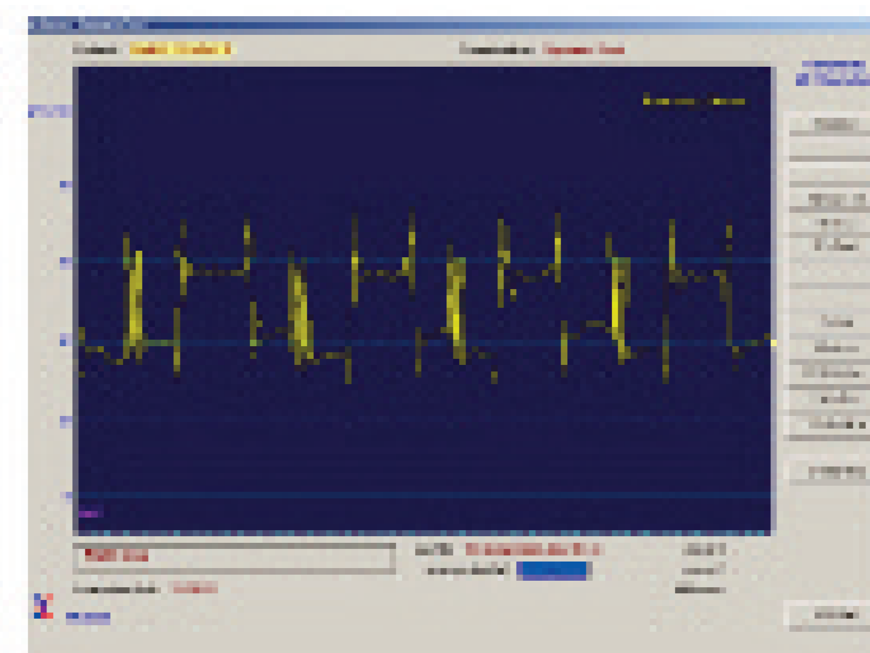
Velcro Wrap 24 hr