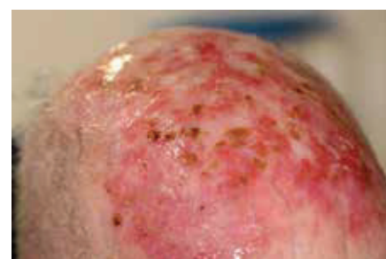
Figures 6 and 7.