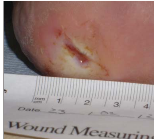
2. Heel wound on presentation