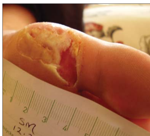
7. Metatarsal epithelialising at 19 days