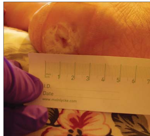
4. Heel wound after 4 days