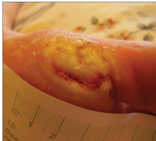
3. Metatarsal wound after 4 days