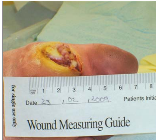
1. Metatarsal ulcer on presentation